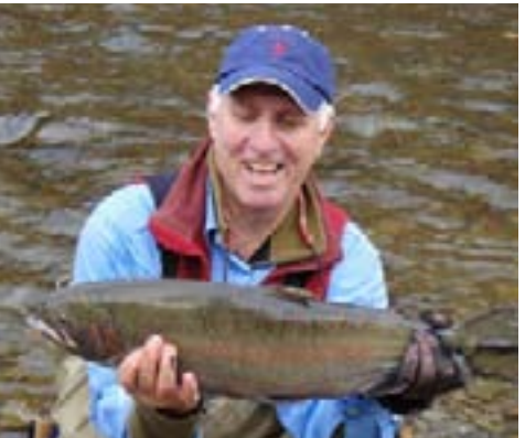
Some recent Club catches!